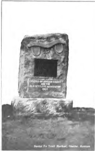
MARKER ON THE SANTA FE TRAIL.

Soon after the beginning of the present century, the Daughters of the American Revolution in Kansas began to agitate the subject of marking the line of the Santa Fe trail through the state. By the act of March 1, 1905, the Kansas legislature appropriated $1,000 "for the purpose of pro-